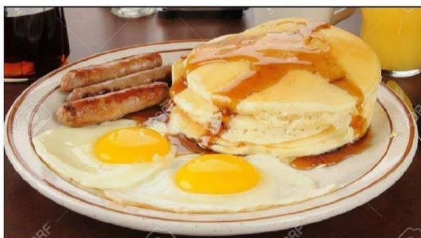
KNIGHTS OF COLUMBUS PANCAKE BREAKFAST

KNIGHTS OF COLUMBUS $1000.00 draw will take place on Friday December 6th at Holy Trinity. To purchase ticket please contact Tom Hart.